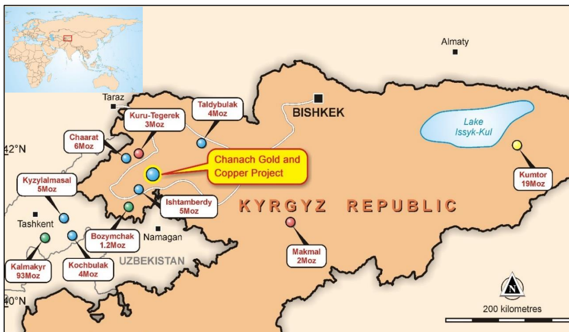
Figure 3: Chanach Project Location