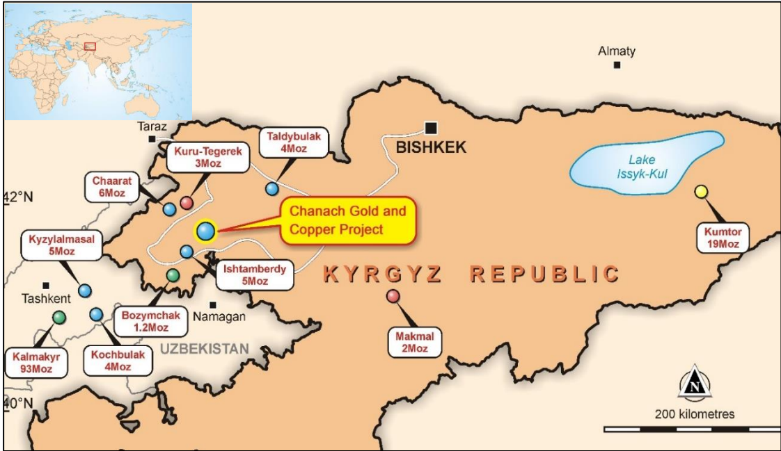
Figure 2: Chanach Project Location

To date the limited exploration activities have defined an Inferred Mineral Resource of 2.95 Mt @ 5.11 g/t Au for 484,000 ounces of Au and 17.23 Mt @ 0.37% Cu for 64,000t of Cu.